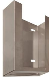
DTM2106 AISI 304 stainless steel